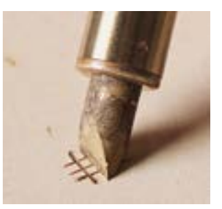
END OF DAY 1